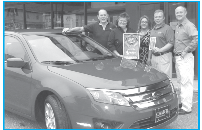
Kovatch Dealerships, Nesquehoning is again our Hole-in-One Partner for this year's CCCC Golf Outing. A lucky golfer may win this brand new car on Hole # 4!

For additional information detailing the golfing and mutually-beneficial partnership and advertising opportunities available, contact our CCCC Office at (610) 379-5000 or mail@carboncountychamber.org. Information can also be downloaded off our CCCC web site - www.CarbonCountyChamber.org. Click on the Golf Outing 2009 logo.